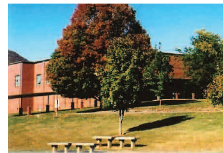
Alumni wanted to preserve the memory of Beaver Creek High School, which operated from 1954 to 1999.

The consolidation of several Ashe County high schools meant that a beloved school in West Jefferson closed its doors for good. And while the building was eventually razed, Beaver Creek High alumni did not want to erase their memories of this school, which operated from 1954 to 1999. The Class of 1957, which