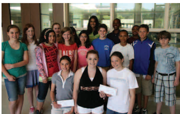
Cary Academy's Student Leadership Club comprises our newest youth program. The middle school group calls itself I.T. for Influential Teens.